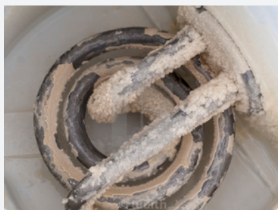
Example of lime-scale deposits from hard water areas.

You probably know about the differences between Hard and Soft water already. That Hard water contains quantities of dissolved minerals (like calcium and magnesium), and Soft water is treated and only contains a level of sodium. But did you know that even Soft water can contain particulates that might diminish the taste of your coffee and potentially damage your machine over time?